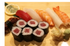
Deluxe Sushi Lunch Plate

Chef's choices of 6 pieces of nigiri and a tuna roll 18.99