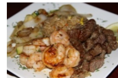
Hibachi Steak & Shrimp