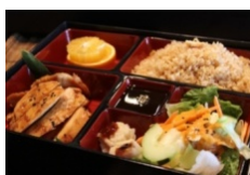
Chicken Teriyaki Bento

Fresh tossed salad, fried rice, fruit of the day, and a chef's choice side item.