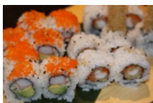
Two Rolls Lunch Plate